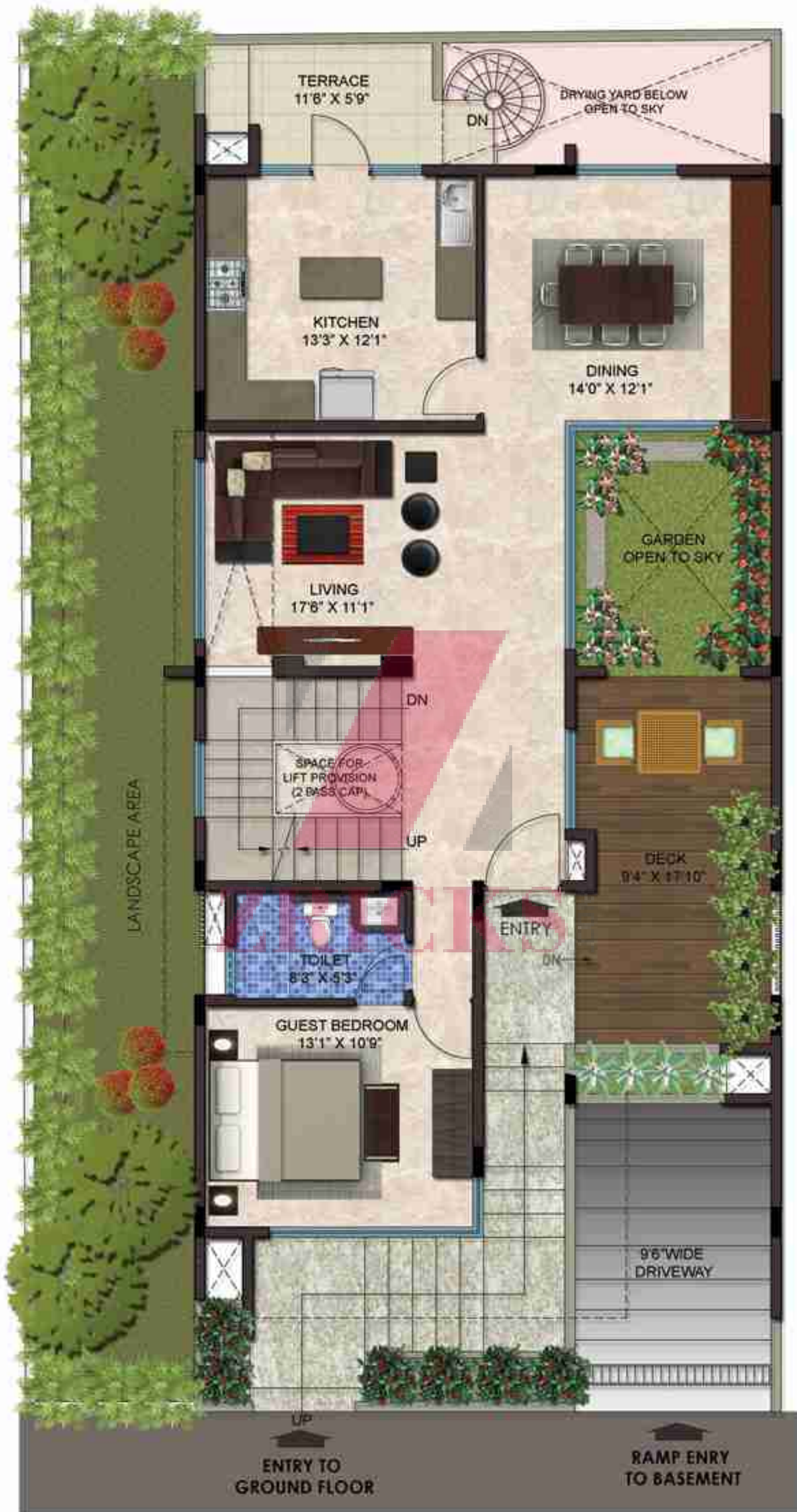
PLAN: GROUND FLOOR