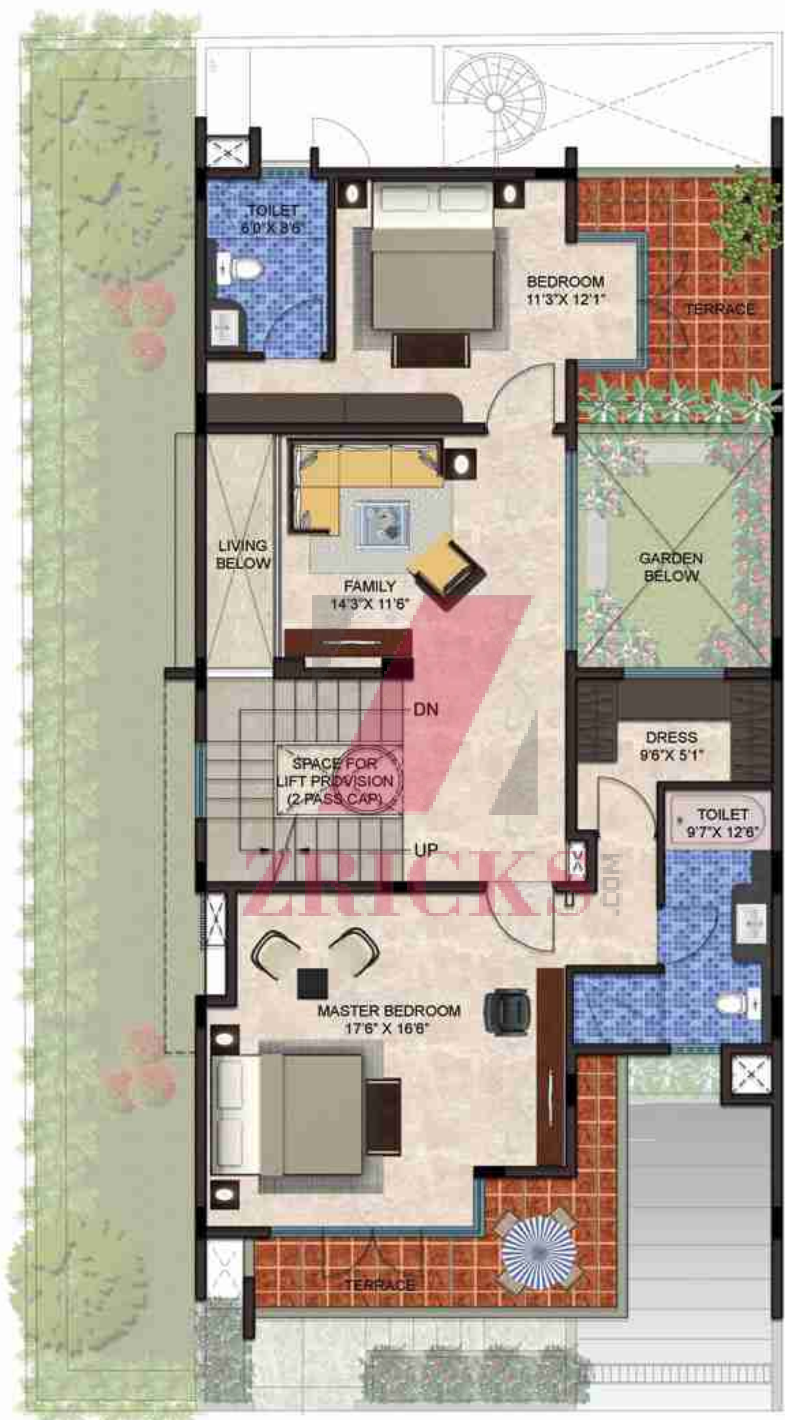
PLAN: FIRST FLOOR