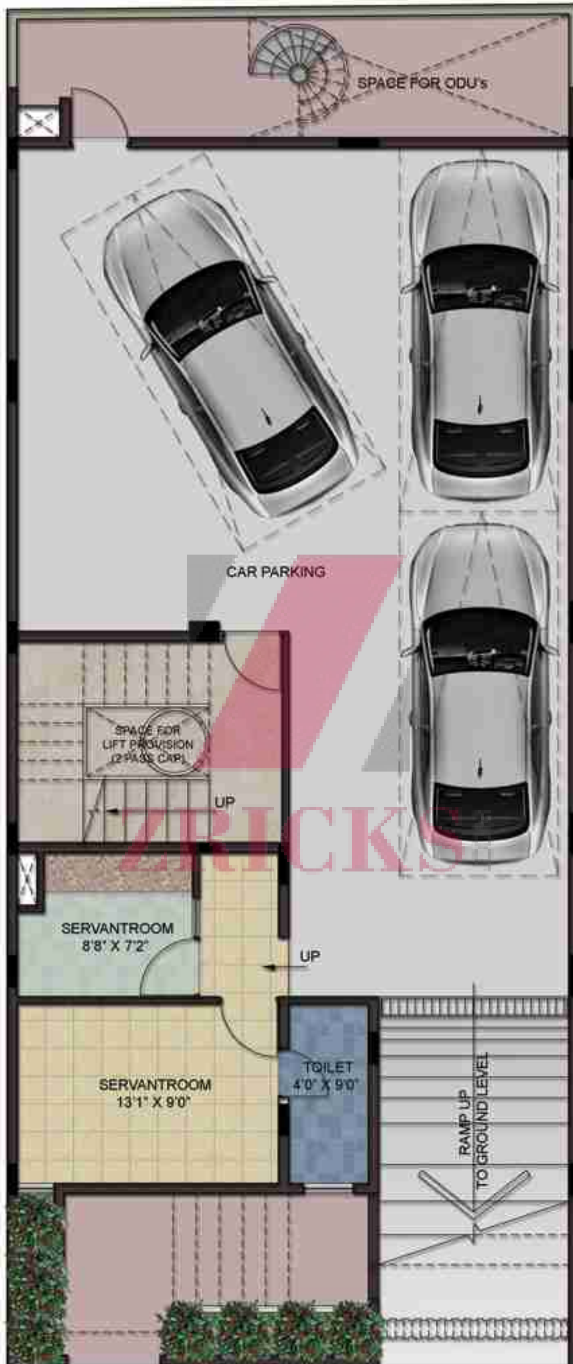
PLAN: BASEMENT FLOOR