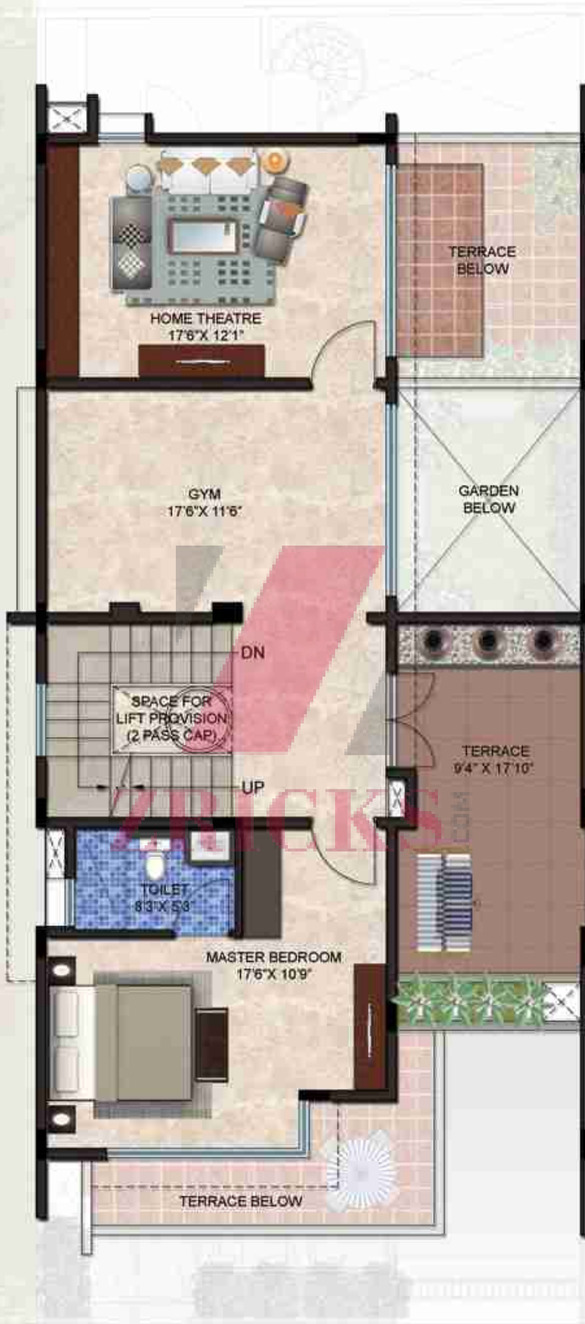
PLAN: SECOND FLOOR